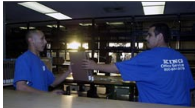
The sun sets — literally and figuratively — on the Library as bookshelves are emptied for the move to the new Library/Learning Resource Center.

A number of employees will work through the weekend to prepare for the opening. They include staff from Maintenance and Operations and Academic Computing, who will be installing all of the computers between now and Monday.