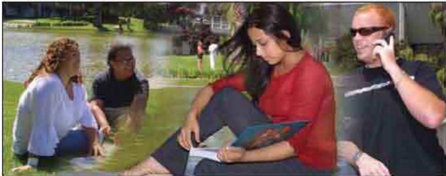
CYPRESS COLLEGE STUDENTS RELAX AT THE "POND." A SURVEY FOUND THAT STUDENTS RATE THE POND AS ONE OF THEIR FAVORITE AREAS ON CAMPUS.

To participate in Cypress College Senior Day 2006, visit your school counselor's office.